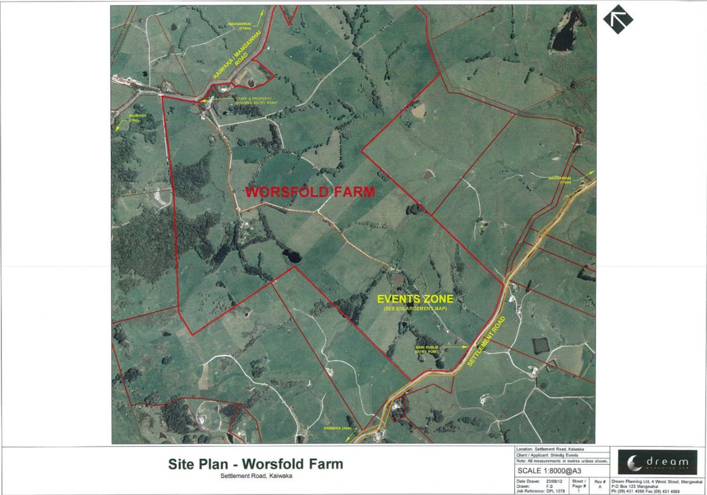
Figure 1: Site Plan of Worsfold Farm